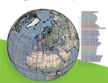
OPERATIONAL CONFIGURATIONS IN ALADIN CONSORTIUM

Significant scientific achievements are published in leading international journals. The ALADIN program coordinates scientific research and implements the scientific results into the new versions of the ALADIN System. These versions are regularly exported and installed on the High-Performance Computers in the Institutes of the ALADIN members.