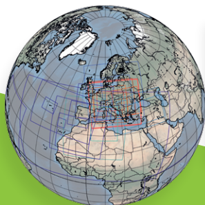
OPERATIONAL CONFIGURATIONS IN ALADIN CONSORTIUM

The activities of the consortium are supported by collective commitments of human resources to the operational and maintenance efforts, and to the management activities. The program has been used as a background to draw extra resources from external funding, both at national and international levels.